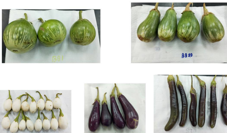
Fig. 2: Different shapes and colours of fruits