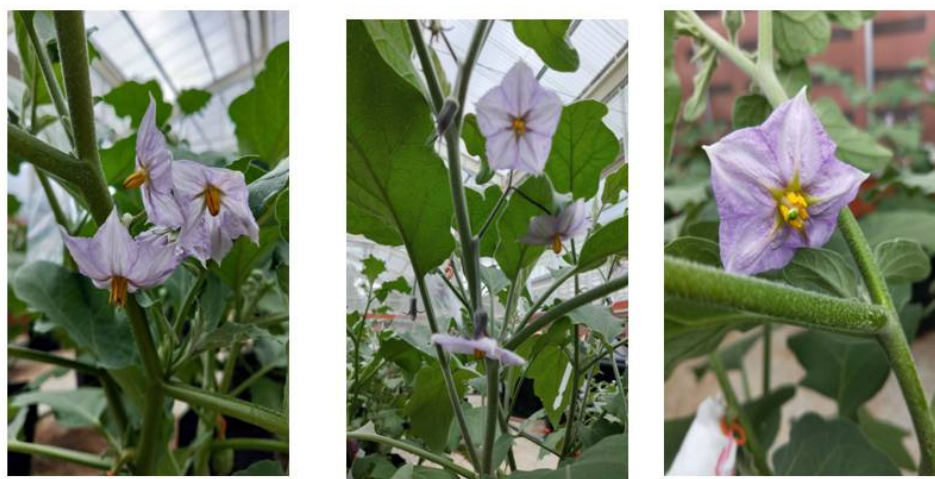
Fig. 3 : Different types of flowering habits