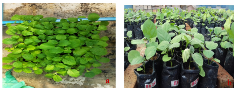
Fig. 1 : Different stage of eggplant seedlings a) 21 days seedlings in germination tray b) Seedlings in polybag for two weeks before transplanting

Note: BB: Brinjal Bangladesh, BM: Brinjal Malaysia, and BT: Brinjal Thailand